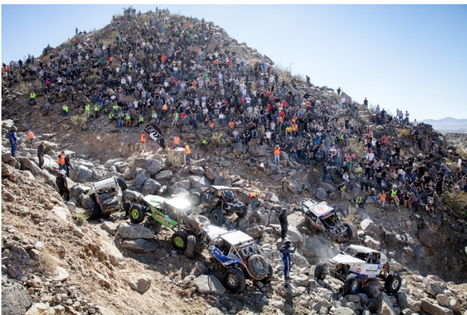
The King of the Hammers / Johnson Valley race. Plenty of